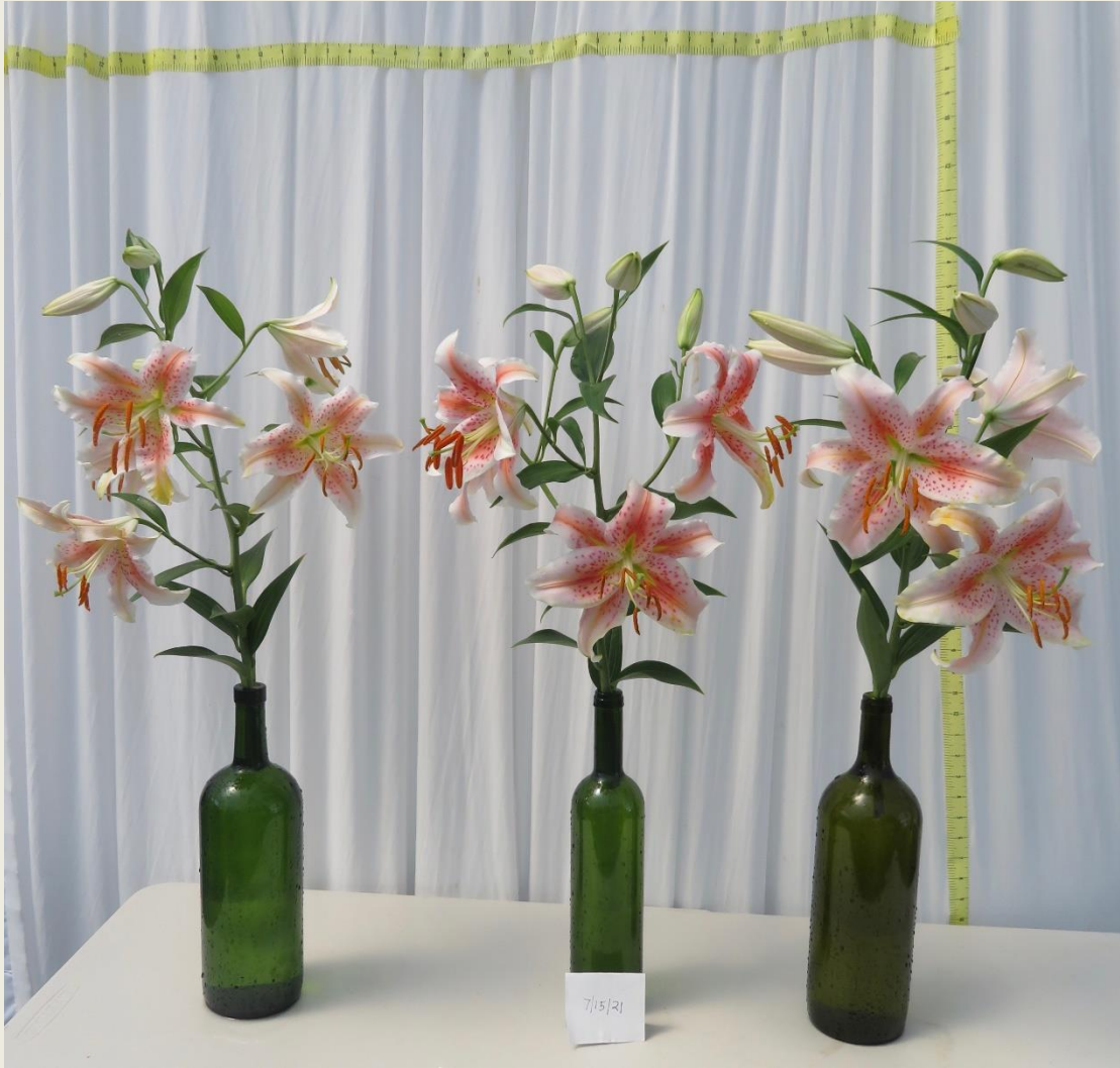
'Salmon Star' , exhibited by Jane Hammond Section:B, Class:19