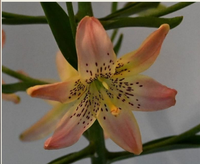
'Corsage' , exhibited by Peggy Nerdahl Section: A, Class: 2