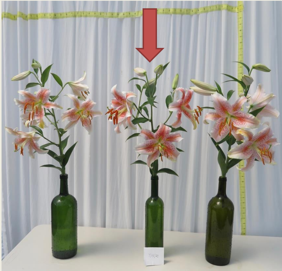
'Salmon Star' , exhibited by Jane Hammond Section:B, Class:19