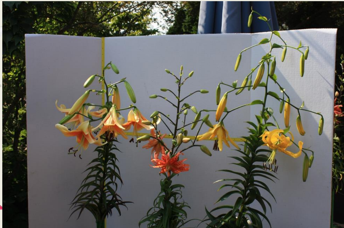
'OT-145-11', 'L.Lancifolium Pleno flora', 'L.henryi citrinum seedling' exhibited by Brian Bergman , Section: B, Class:21