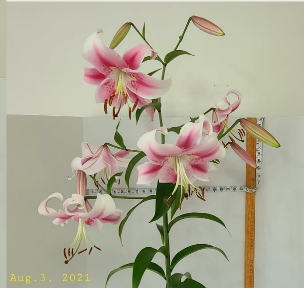
'Anastasia' , exhibited by Yupeng Chen Section: A, Class 17